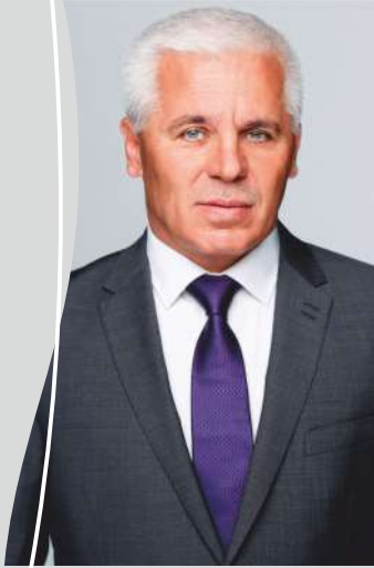
Dr. Ferenc Kovács mayor

A s a Mayor, I am always pleased when young people from abroad arrive to study in our city. They can not only return home with a more open-minded perspective and unique experiences but they can also take back the renown of our city and Hungary.